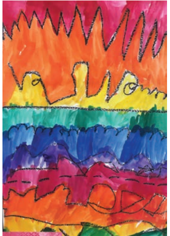
Line and Rainbow Paintings Kindergarten The Kindergartners learned about all different types of lines and even invented some of their own! They filled their paper by drawing lines all the way from side to side with an oil pastel. Then they painted in-between their lines in the correct rainbow order!