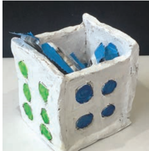
Slab Clay Pots 5th and 6th Grade The fifth and sixth graders learned how to roll their own slabs of clay and some added texture to their slabs using different objects. They then learned how to assemble the slabs into a pot using the score and slip method so that the walls would stay strong! Adding color to these pots enhances the texture and gives them personality!