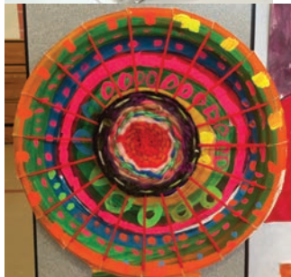
Circle Weavings 2nd Grade The second graders learned about different elements of weaving and then painted plates to use as looms for their own weavings! They learned to warp their looms and used all different types of yarn to weave and make beautiful designs!