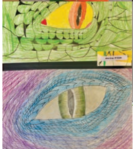
Dragon Eyes 5th and 6th Grades The 5th and 6th graders practiced drawing detailed dragon eyes focusing on scale, texture, and variety! They then used different colored pencil techniques to create value and focus on a color scheme. Adding different scales, horns, and details make these dragons all one of a kind!