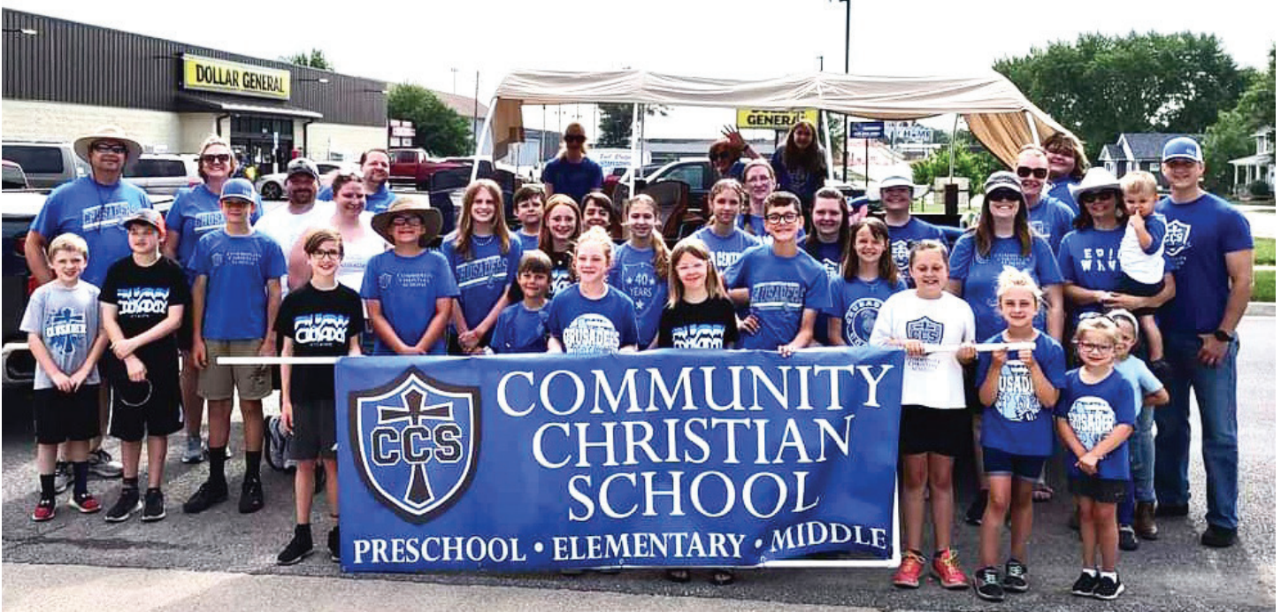
The CCS entry in the Frontier Days Parade earned first place among religious entries and second place for theme. It was a covered wagon titled 'The Traveling Crusaders from Community Christian School.' The parade theme was 'Tall Tales of the Frontier.'