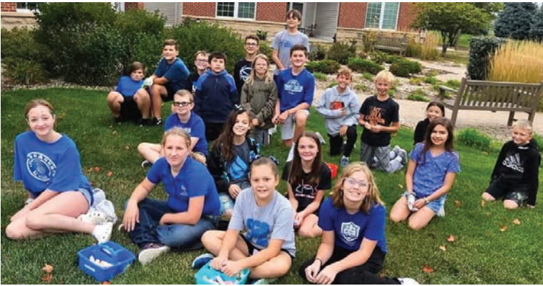
The fifth-sixth graders gather at the nearby hospice house for a service project.