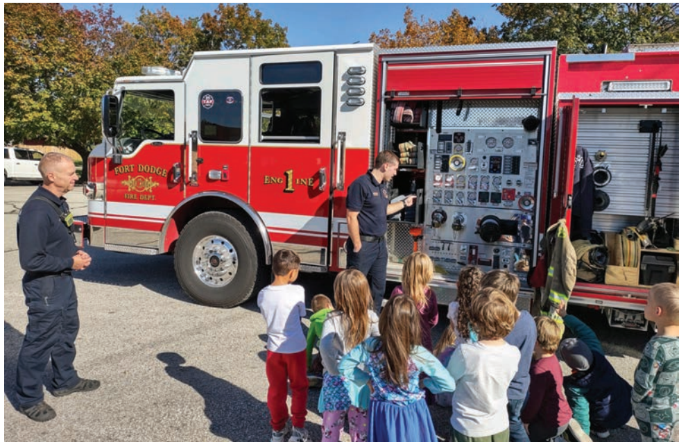
Local firefighters show students the inner workings of a fire truck during Fire Prevention Month.