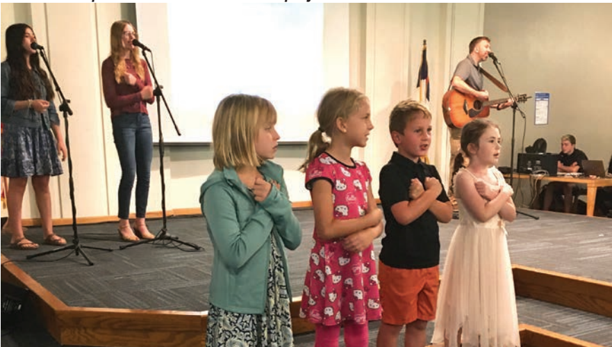
Students take turns serving their fellow students all year long during chapel. Some are singers (at left), some demonstrate actions (front), and others help with technology (far right).